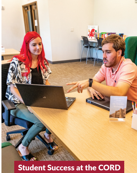
Student Success at the CORD

For more information, visit success.uark.edu .