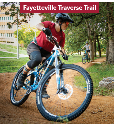
Fayetteville Traverse Trail

For more information about club sports and recreation on campus, visit urec.uark.edu .