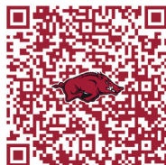
Dining Information & Rates