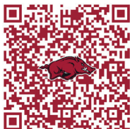
Transfer Housing FAQ

Dining at the University of Arkansas offers transfer students multiple convenient and flexible options. With a variety of meal plans available, students can choose the one that best fits their needs. The campus features numerous dining halls and eateries, providing a wide range of nutritious and delicious meals. Special dietary needs are accommodated, ensuring that all students have access to quality food throughout the day. For more details, visit dining.uark.edu .